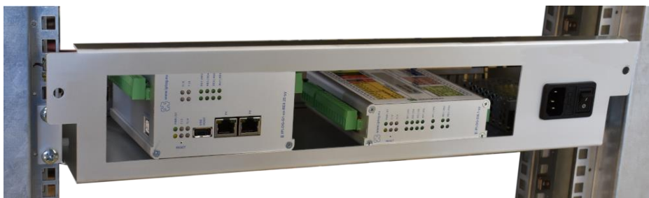
2U Version with Fitted Modules